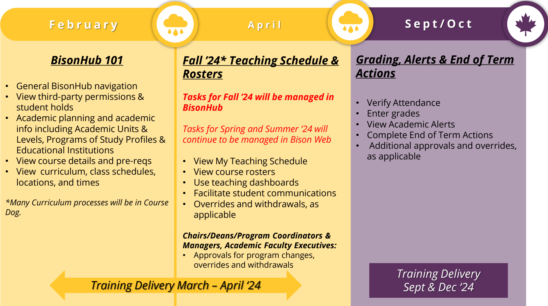
Appendix – Full Faculty Training Timeline : Faculty